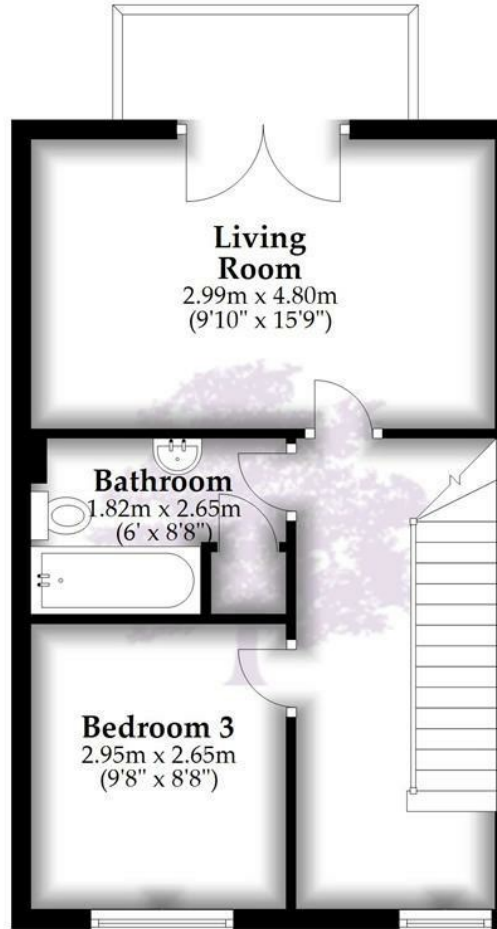
First Floor Approx. 38.2 sq. metres (411.5 sq. feet)